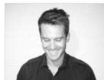
HERE TO INSPIRE Op-ed: Reluctant Words of a Newly HIV+ 20-Something