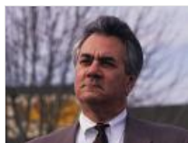
POLITICIANS When Barney Frank Came Out of the Room