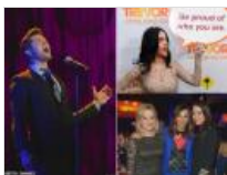
YOUTH PHOTOS: Trevor Project Gala Brings Out Loads of Stars