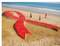
HERE TO INSPIRE See Dramatic Photos from World AIDS Day 2012