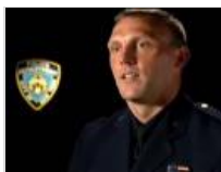
YOUTH WATCH: NYPD to LGBT Youth: 'It Gets Better'