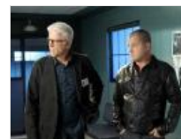
COMMENTARY Op-ed: How TV's CSI Is Screwing Us Again